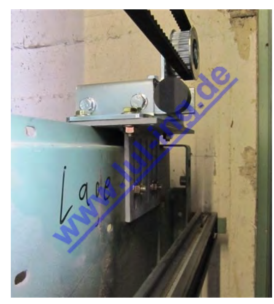
Fig. 7: TSG deflection roller