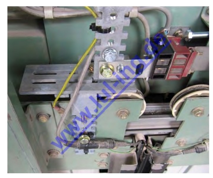
Fig. 9: TSG door panel carrier