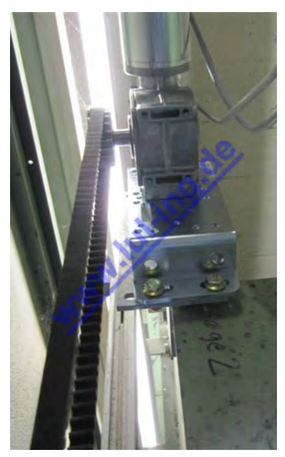
Fig. 4: TSG drive side