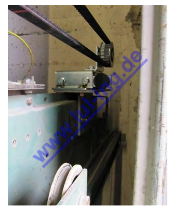
Fig. 5: TSG deflection roller