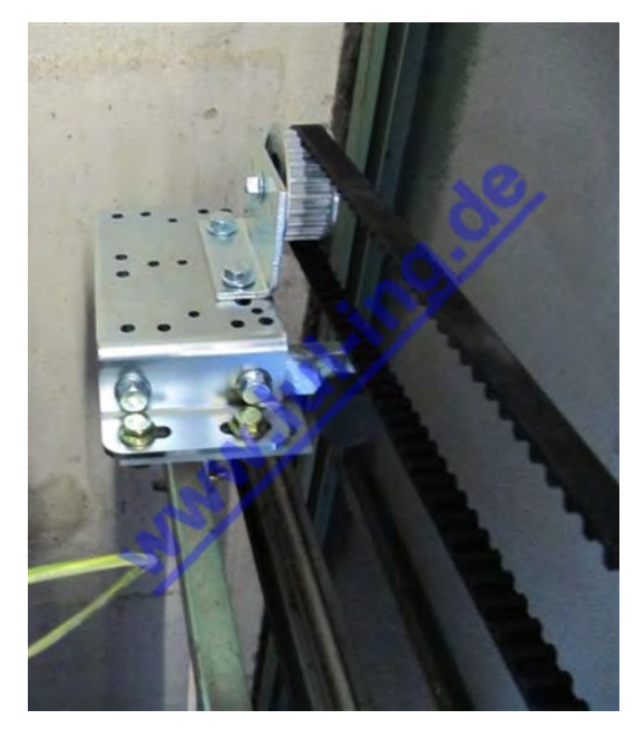
Fig. 6: TSG deflection roller