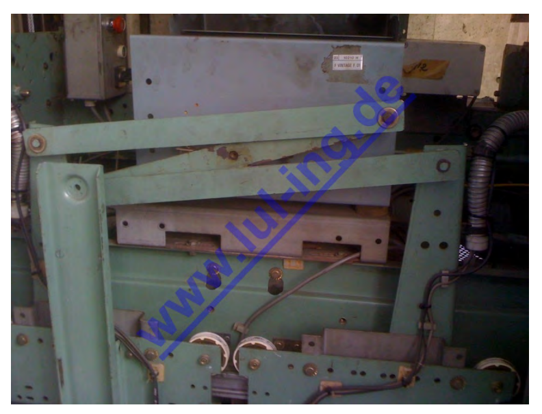
Fig. 1: Otis MRDS before conversion