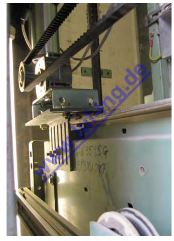
Fig. 3: TSG drive side