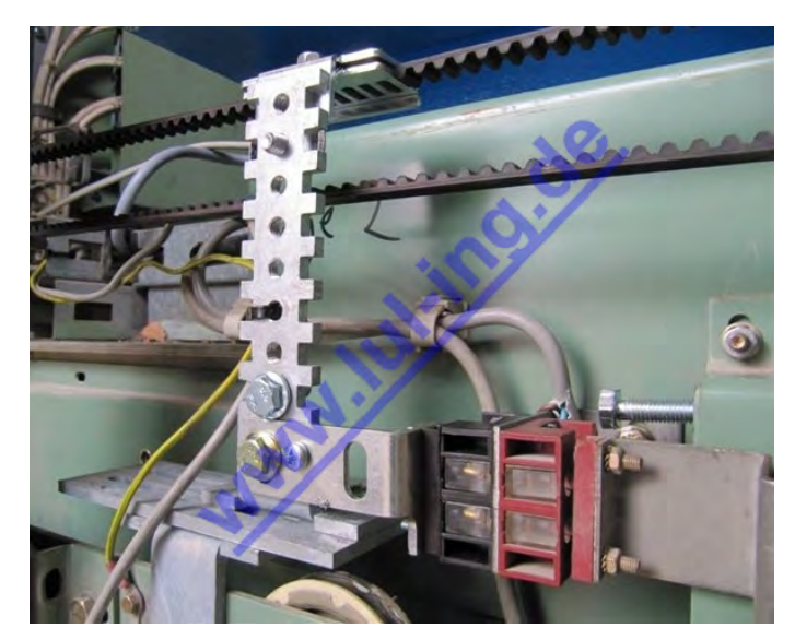
Fig. 8: TSG door panel carrier