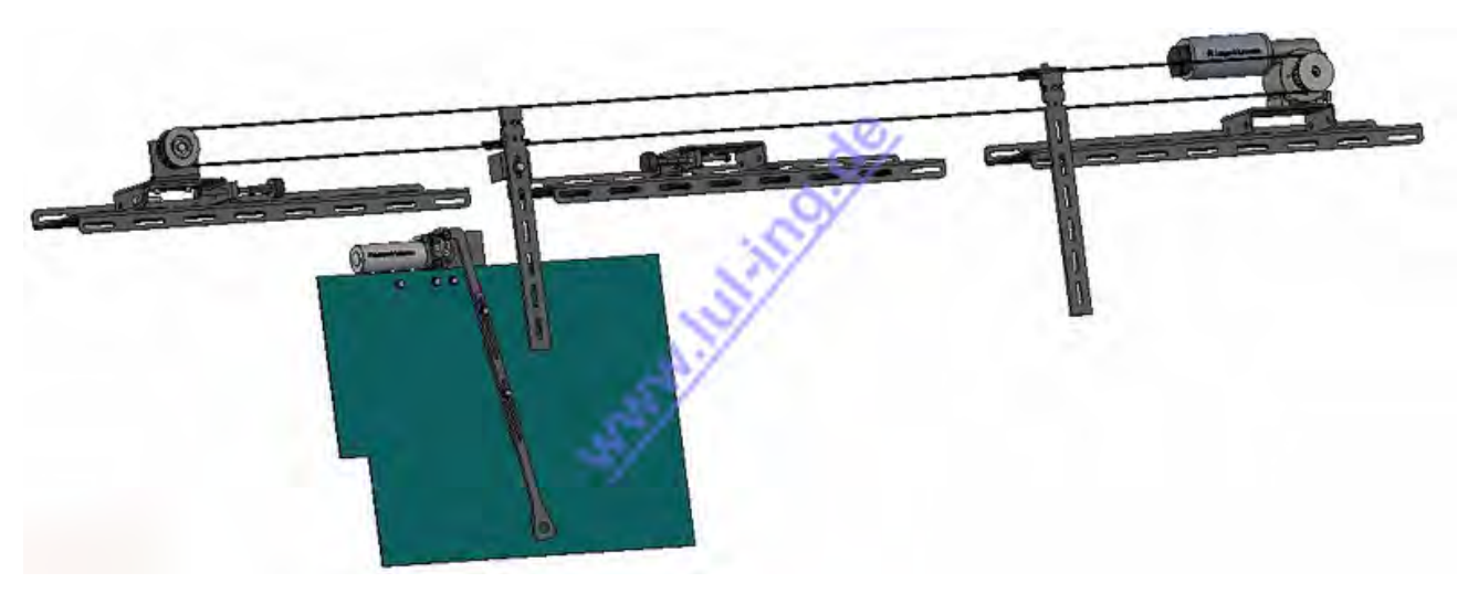
Fig. 2: TSG in Otis OVL, after conversion