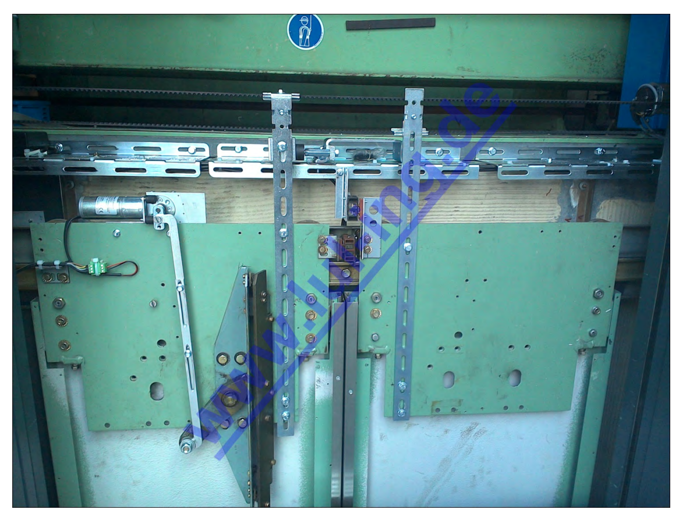
Fig. 6: Converted Otis OVL door