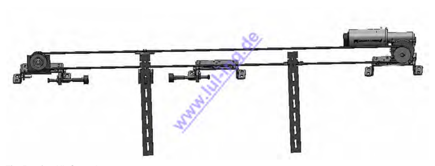
Fig. 5: Otis OVL Central