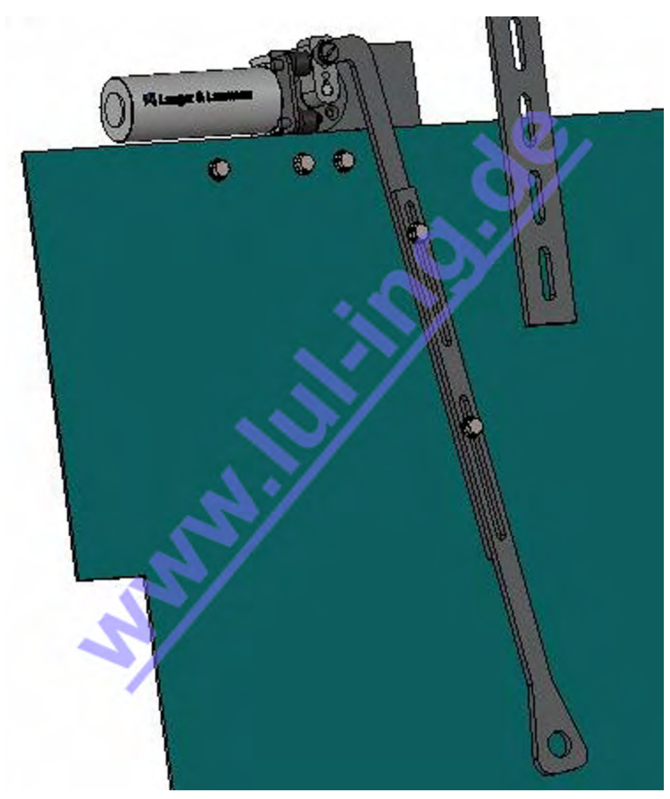
Fig. 3: TSG additional drive