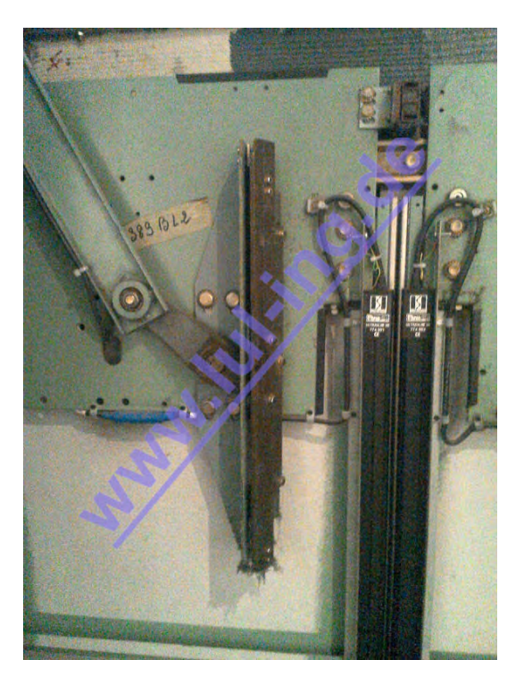
Fig. 4: Original skate