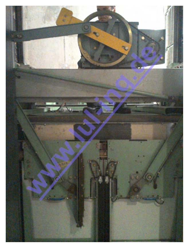
Fig. 1: Otis OVL before conversion